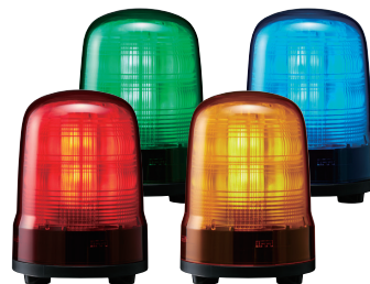
Multi-function Beacons SF series